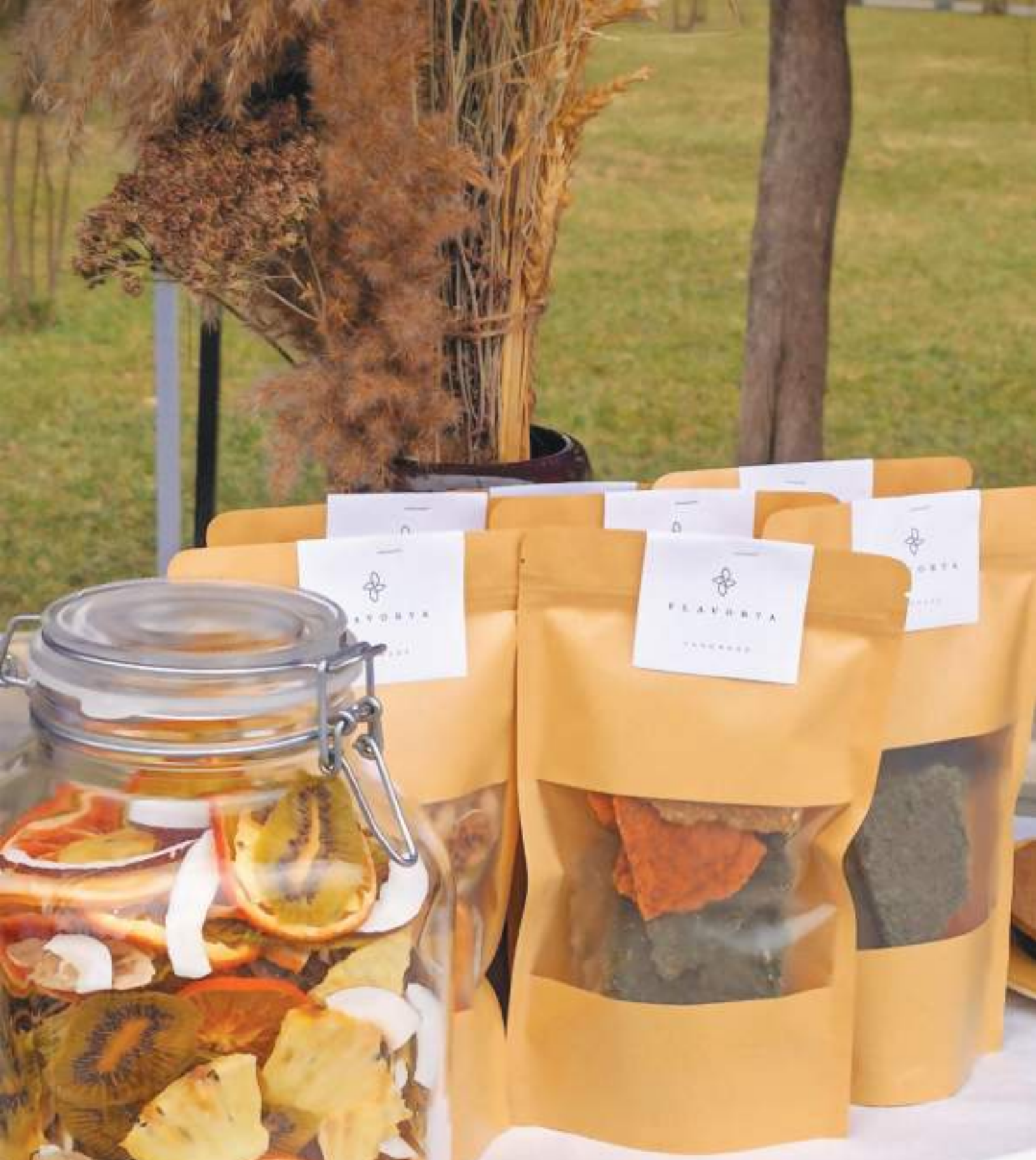
Dried fruits and pastilles