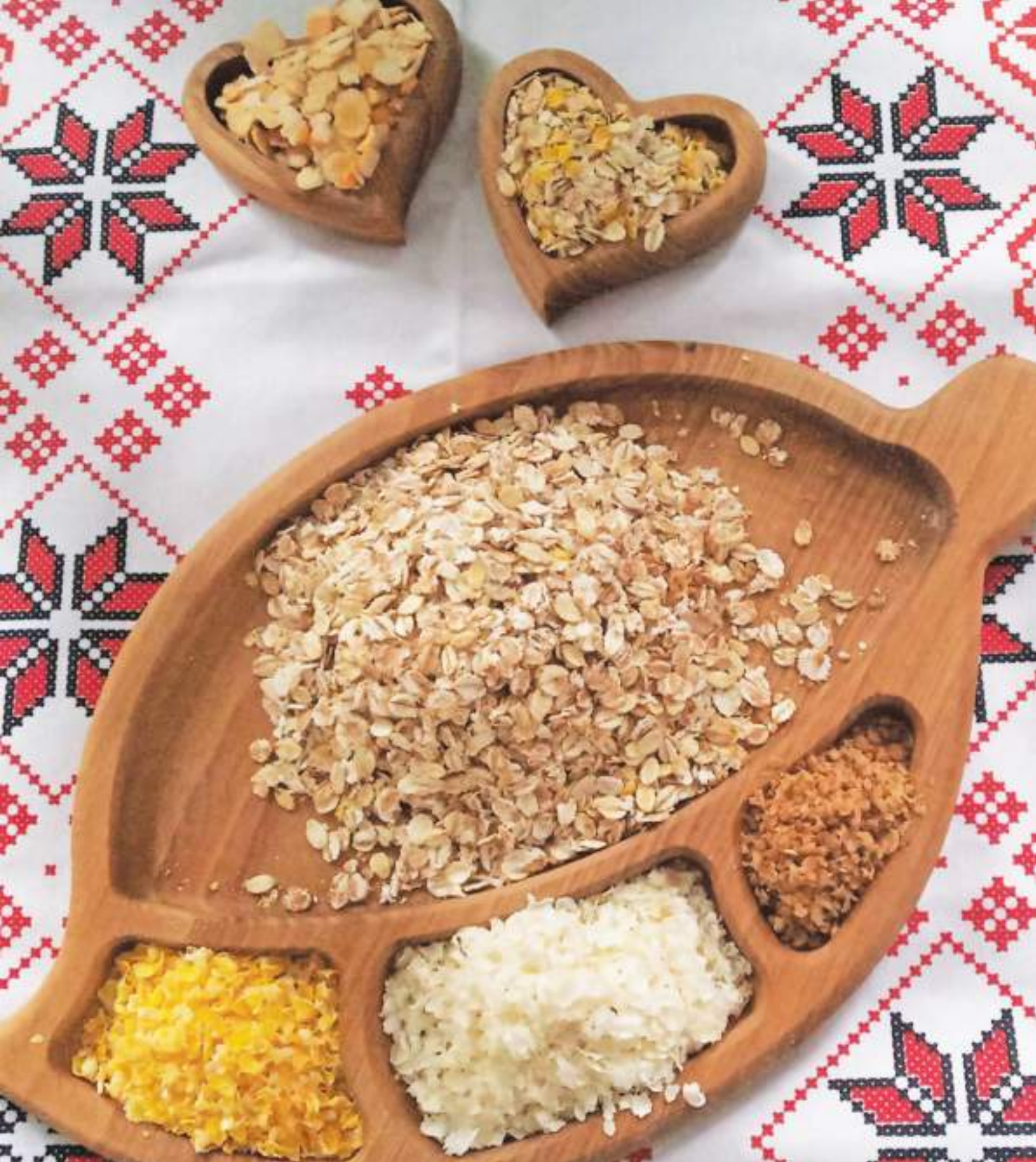
Granola and cereals