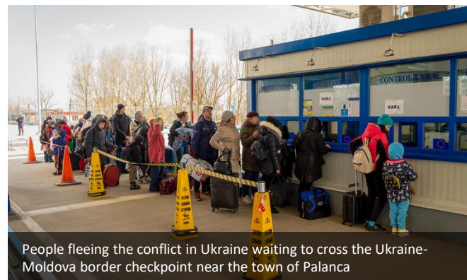
People fleeing the conflict in Ukraine waiting to cross the Ukraine-Moldova border checkpoint near the town of Palanca

WFP IS WORKING WITH THE MOLDOVA GOVERNMENT, UNHCR, IOM AND EUCPT TO PRODUCE AN ESTIMATION OF POSSIBLE REFUGEE INFLUX PEAK SHOULD THE SECURITY SITUATION IN SOUTHERN UKRAINE DETERIORATE