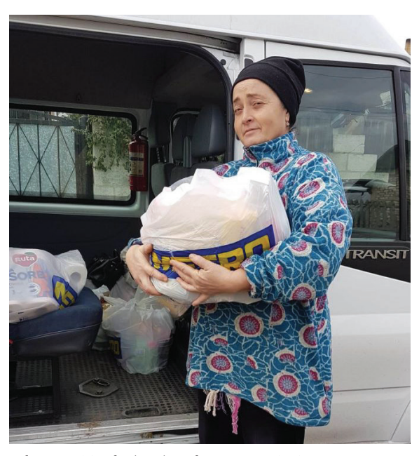
Refugee receiving food products from NGO Motivatie

Lack of food for infants or formula-fed children is a challenge. In the beginning there was food for children, but now these are no longer offered, (Representative of RAC, female, Chisinau).