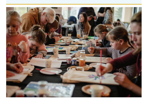
Children participating in a painting workshop

Mothers with children in primary education are not able to work at all, as they are not able to leave their children unattended and need to help them with homework. Mothers with children in secondary education are forced to leave them at home for online schooling without supervision, (Refugee Women Leader from Ungheni).98