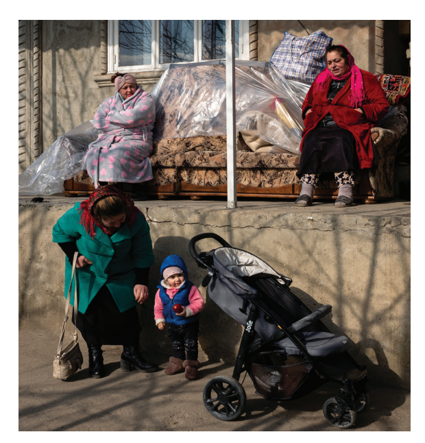
Roma family from Ukraine outside of their shelter house in Drochia

It is much harder for women coming from urban areas to be accommodated in villages where sometimes they lack proper infrastructure: outside toilets, bathrooms, water supplies or sewage. Women with infants find it particularly difficult because they have to adjust to their children' needs, (CSO Representative, female, Chisinau).