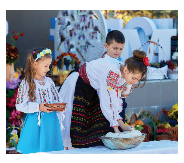
Refugees and locals of Cruzești commune participating in a festival for peace

UNHCR's Participatory Assessment reports that Roma refugee respondents were welcomed by the network of Roma community mediators in Moldova which helped them feel safe and accepted. The Romani language spoken by Roma communities in Ukraine and Moldova is similar which facilitates communication. While strong social solidarity for Ukrainian Roma within the Moldovan Roma community has provided a source of strength and protection, they continue to be marginalised amongst the broader Moldovan society.